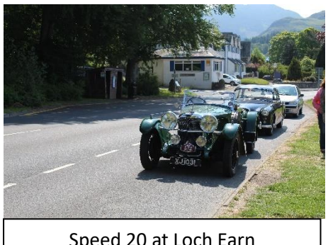
Speed 20 at Loch Earn

After a hearty breakfast on Saturday morning, we embarked on a little sightseeing of the area. As we had driven over 500 miles, we decided not to do the Longstone Tour this time, but instead have a little drive around the area, which Barbara had never visited before. We set off for Loch Earn. A really beautiful spot, where we bumped into a couple of other Alvis owners, Hugh and Candy Stirling.